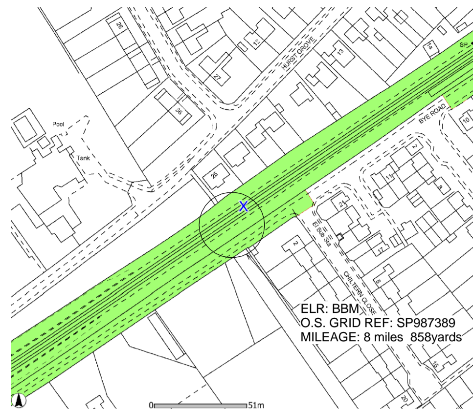
PLAN SHOWING NETWORK RAIL LAND OWNERSHIP