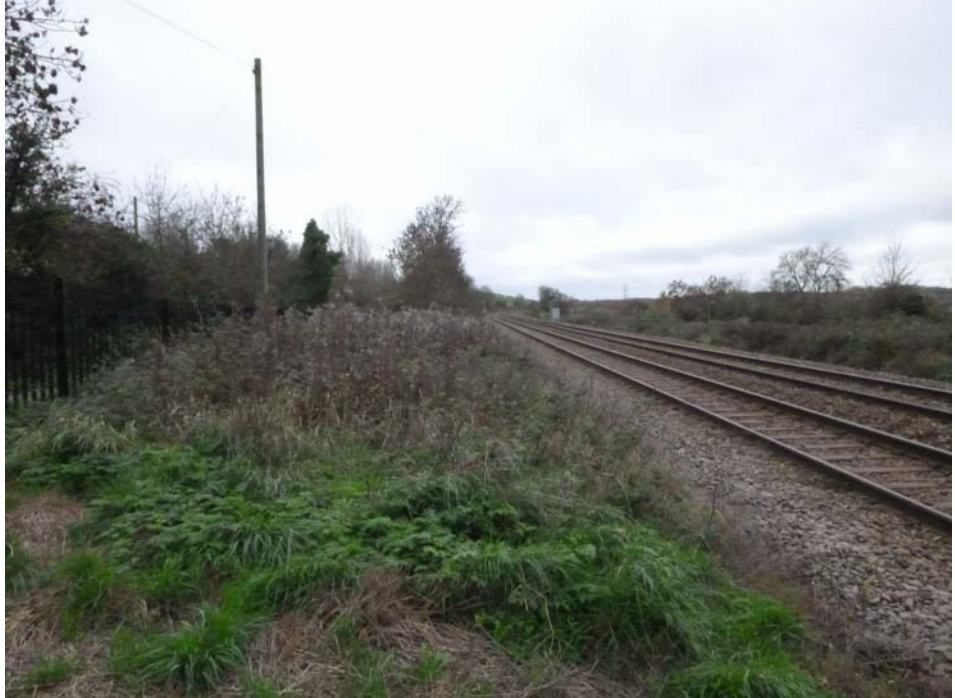
LOCATION OF ACCESS STEPS ON SOUTH SIDE