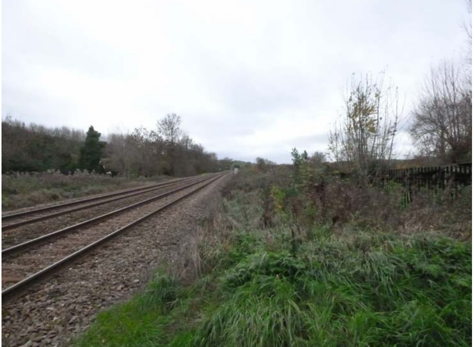
LOCATION OF ACCESS STEPS ON NORTH SIDE