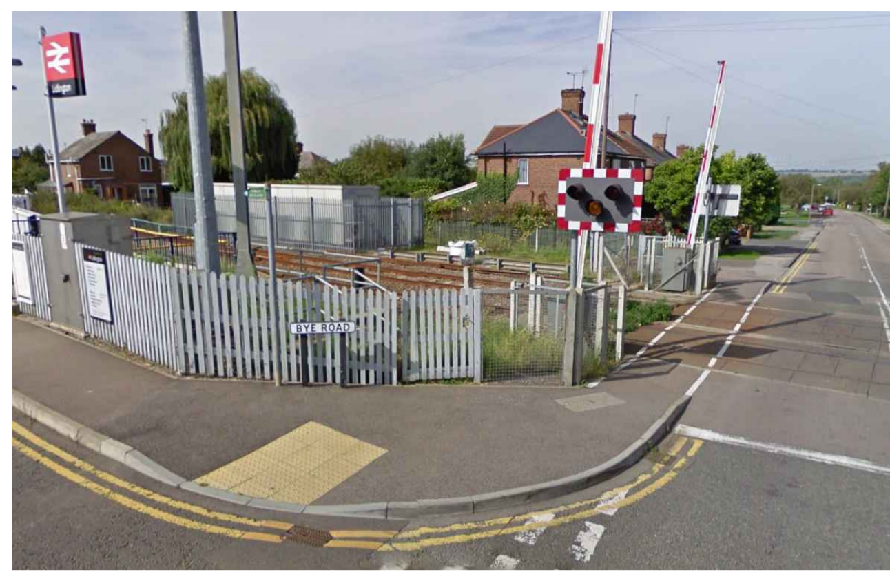
PHOTO SHOWING LEVEL CROSSING AND JUNCTION OF BYE ROAD AND CHURCH STREET