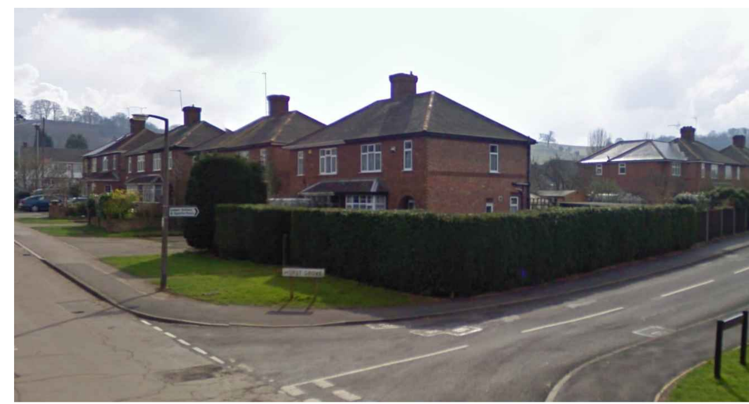
PHOTO SHOWING JUNCTION OF STATION ROAD AND HURST GROVE